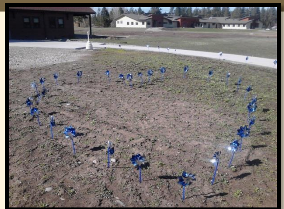
Check out the pinwheel garden that the ECED 265 leadership and professionalism class created.